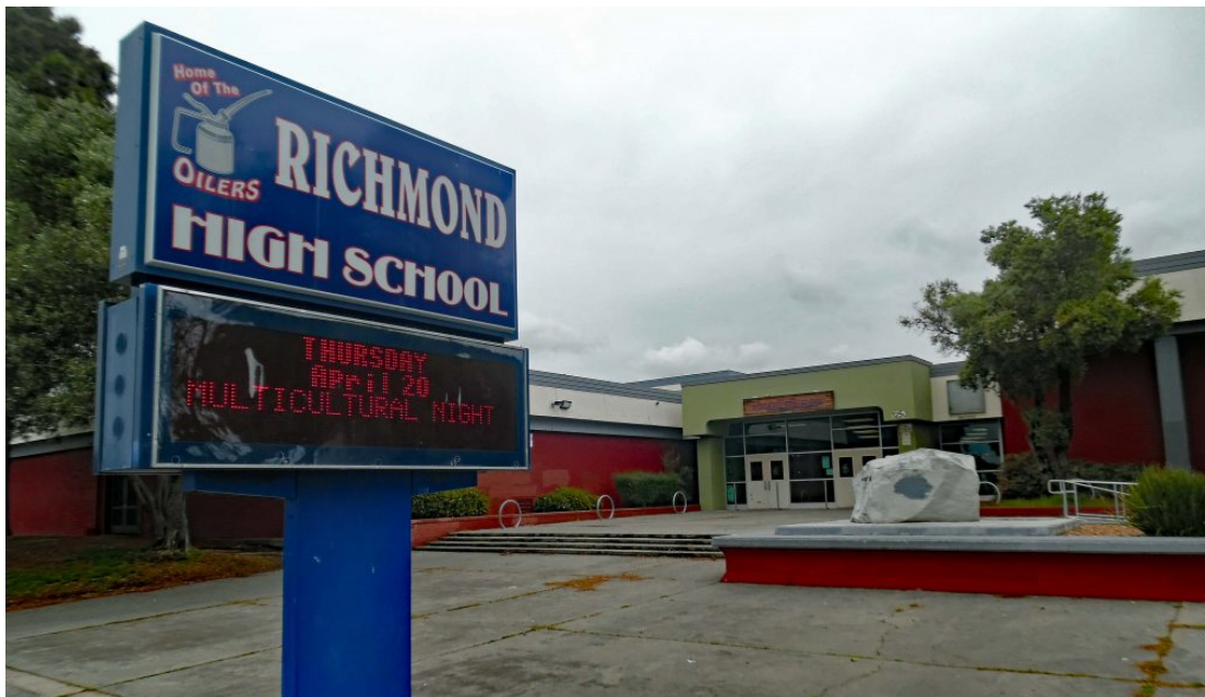
Richmond High at 1250 23rd St.

Richmond High School is set to unveil the opening of its “Internationals Academy” on Thursday, which is described as “an academic pathway to college and English fluency for newcomer students.”